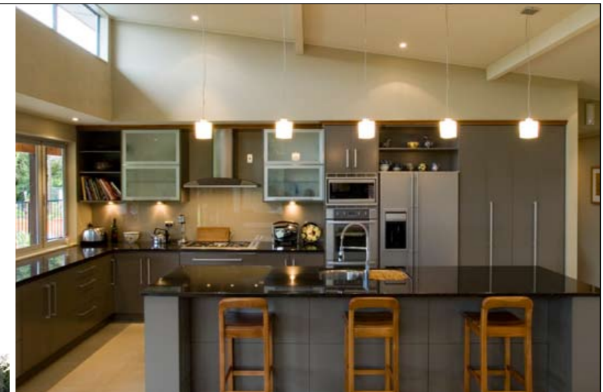
The designer kitchen is stunning, specifically designed to meet the needs of a couple who love to entertain

Guests can sit down with a glass of wine, chat with the hosts, and look across to the in-ground swimming pool.